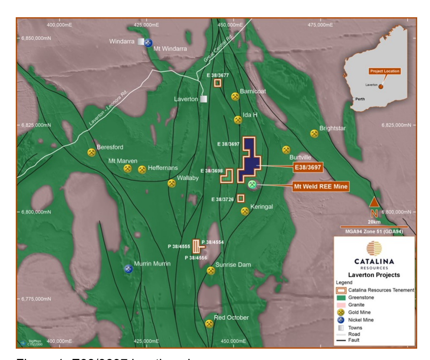
Figure 1: E38/3697 location plan

The program comprised twenty-five Aircore holes for a total meterage of 1,593m (Appendix 1). Twenty holes were drilled in four traverses to test for gold mineralization along the interpreted strike of the Barnicoat Shear Zone between the Lily Pond Well and Pendergast gold prospects (Figure 2-3). The remaining five holes were drilled to test for rare earth element (REE) mineralization associated with point source magnetic anomalies modelled by Southern Geoscience Consultants.