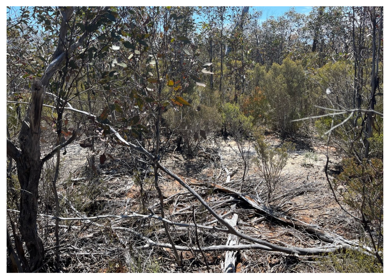
Figure 3. Sample piles from another drill hole obscured by heavy vegetation regrowth.