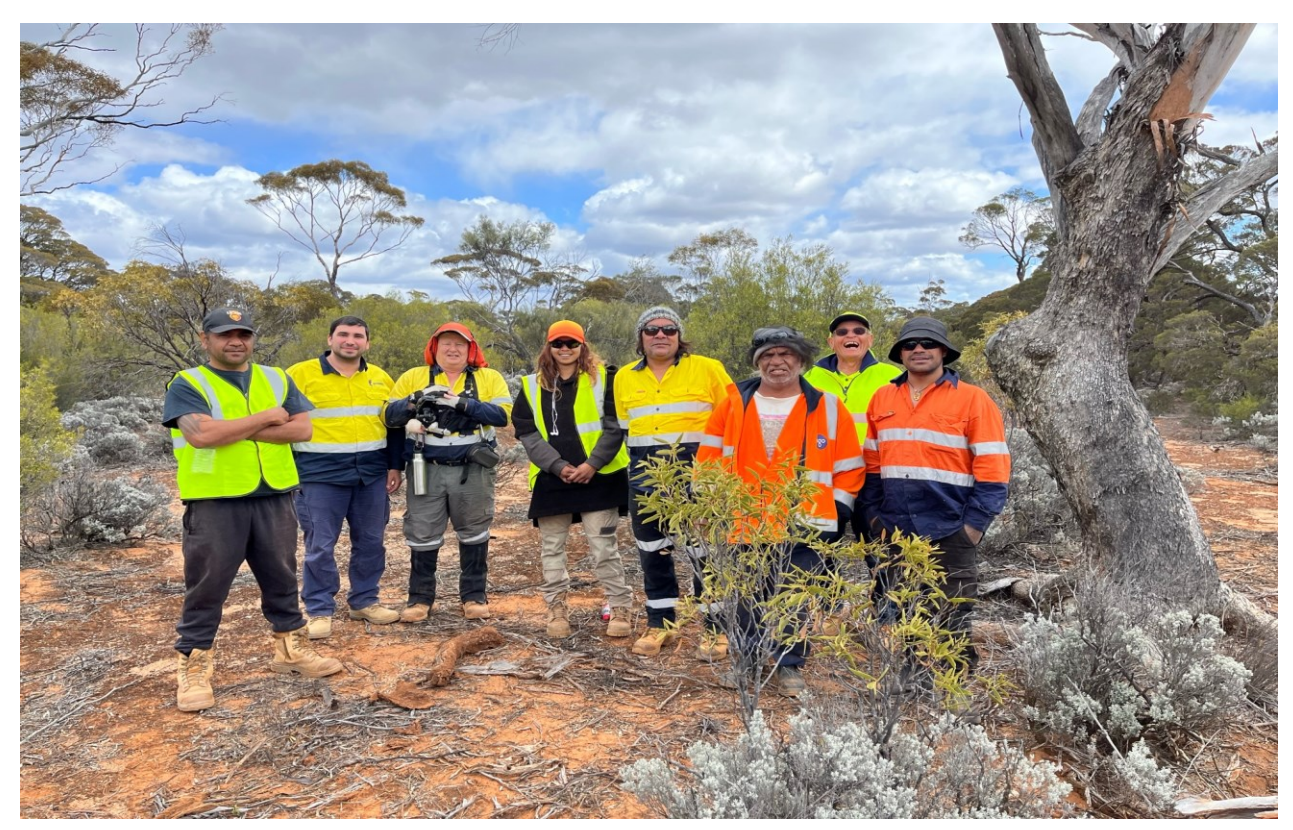
Figure 5. Members of the Ngadju Native Title Aboriginal Corporation (NNTAC) on site at Dundas Project in October 2022.