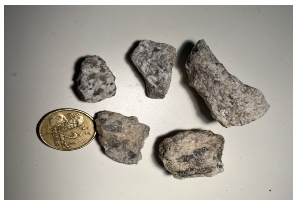
Figure 1. Pegmatite chips from old drill spoil at the Dundas Project.