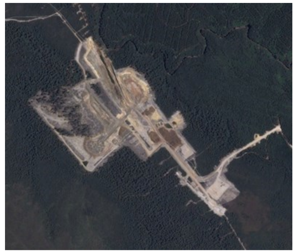
Figure 3 shows the existing mine development on site. The main features are the DSO pit and waste dumps. Other elements are the mine water treatment dams, ROM stockpile area and the facilities area.

The DSO pit is some 25% complete, with waste rock materials deposited in two dumps designated as the Non-Acid Forming ("NAF") waste rock dump and the Potentially Acid Forming ("PAF") waste rock dump.