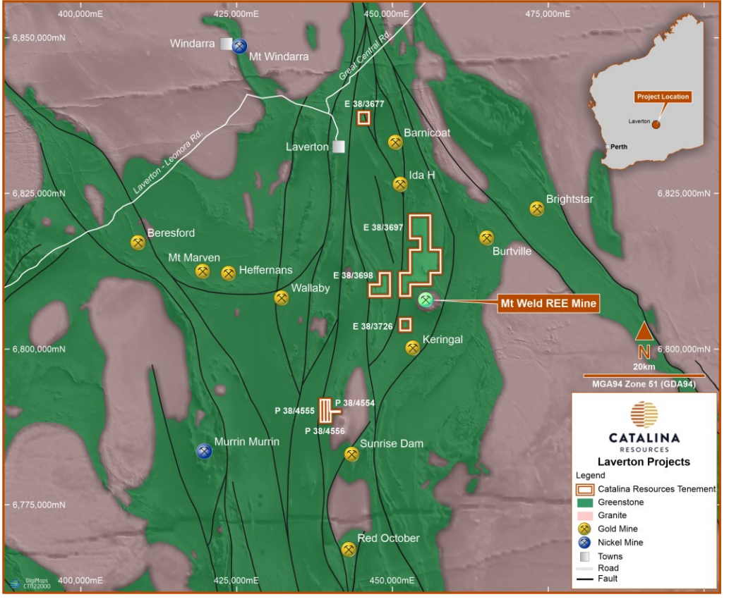
Figure 3. Regional location diagram of Catalina's tenements, including E38/3697, in the Laverton Tectonic zone

A summary of the exploration targets generated on E38/3697 is listed below: