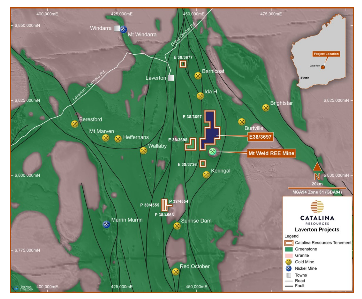
Figure 1: Location map of Catalina's E 38/3697 and other tenements in the Laverton Gold Province.

Catalina has identified several very compelling target areas with potential for gold, nickel and REE mineralization within E38/3697. The targets were generated by the integration of detailed aeromagnetic images, geological interpretations, ground gravity images and historical exploration data. Reference was also made to genetic models developed for neighboring mineral deposits. The compilation revealed that historical drilling within the tenement has been sporadic and non-systematic with significant geochemical anomalies not followed up.