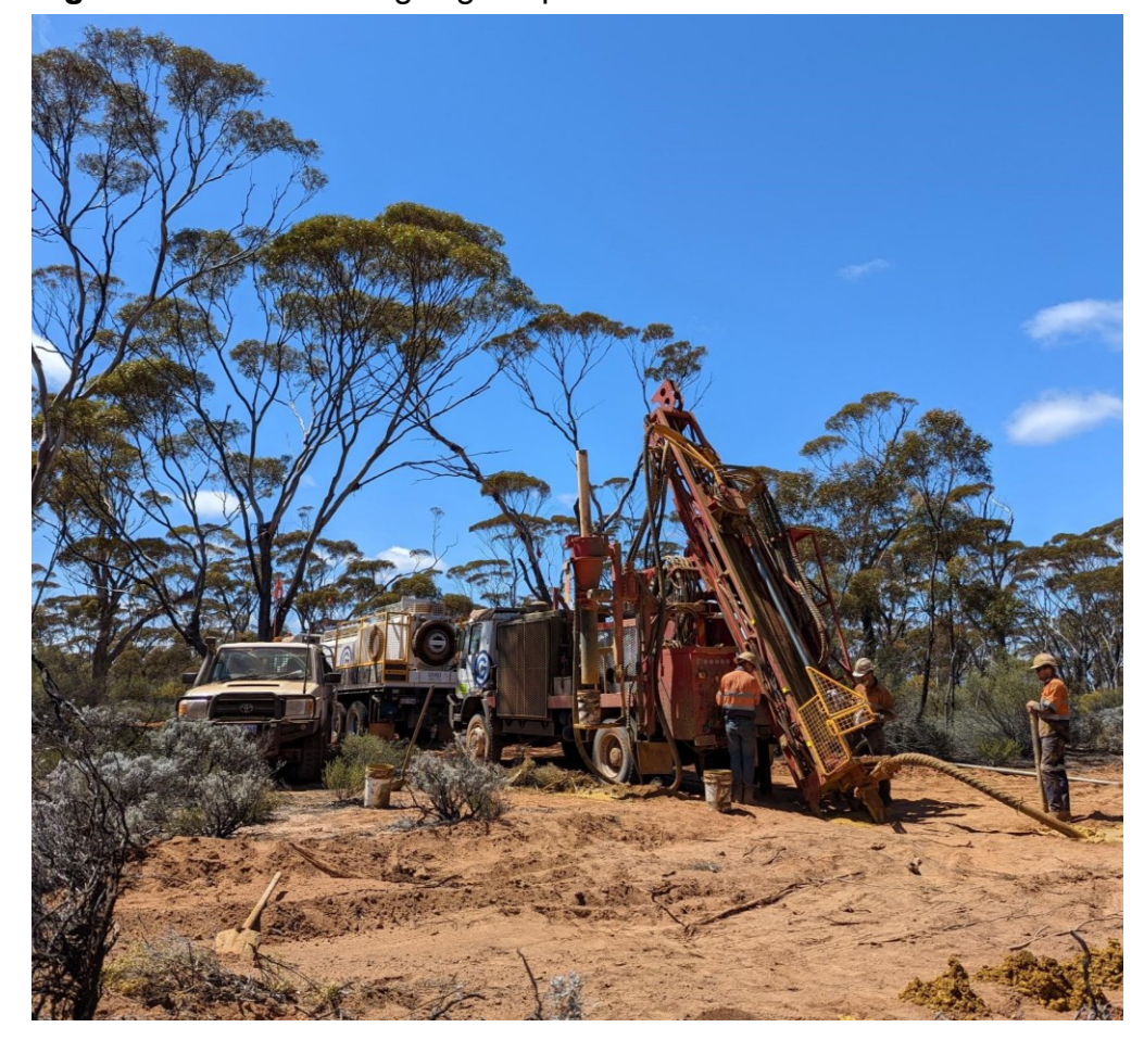
Figure 1. Aircore Drilling Rig in operation at E63/2046.