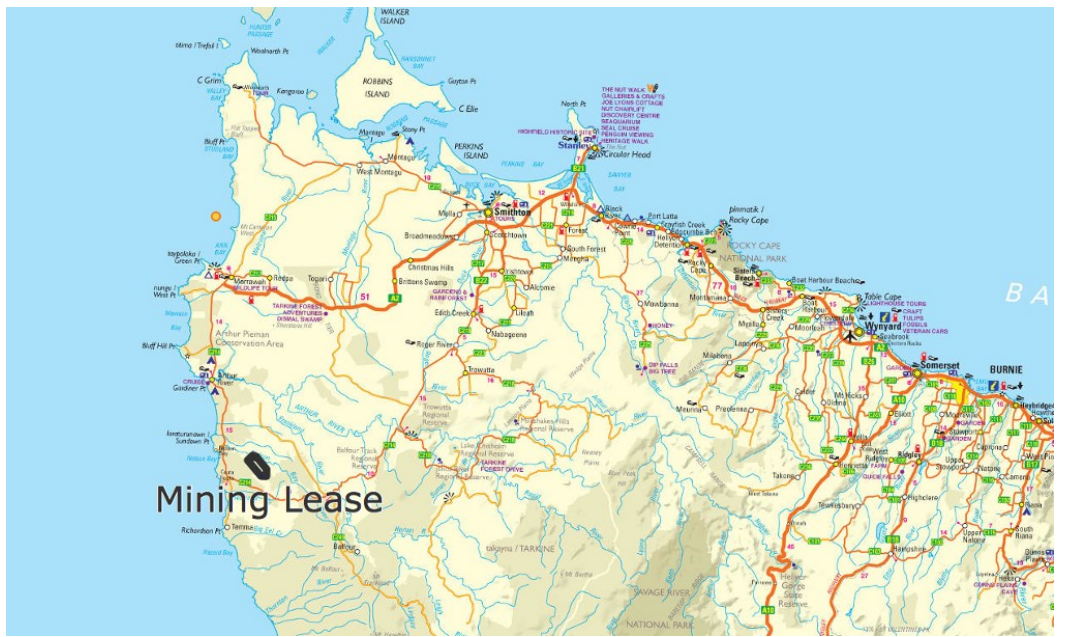
Figure 2: Location Plan – NW Tasmania

The Project is within an established mineral province in the region. Operating mines include Grange Resources' (ASX: GRR) Savage River Iron Ore.